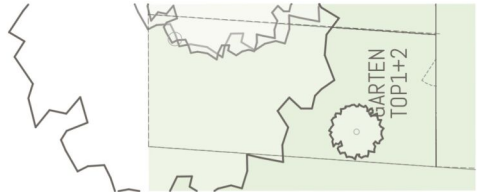
TOP1+2 Übersichtsplan Garten