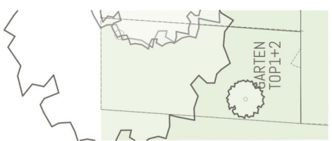
TOP1+2 Übersichtsplan Garten