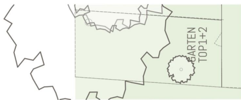
TOP1+2 Übersichtsplan Garten